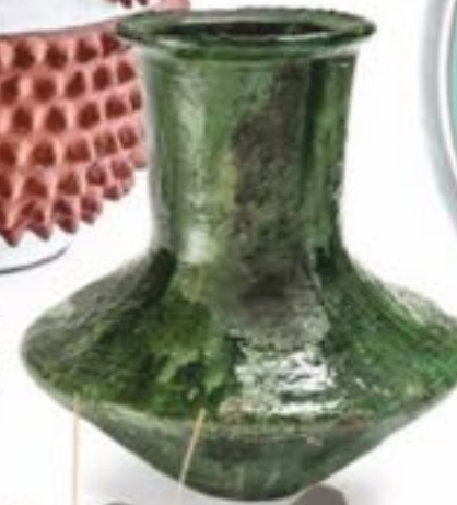
'RICCI' VASE IN GREEN, R6 400, LA GRANGE INTERIORS