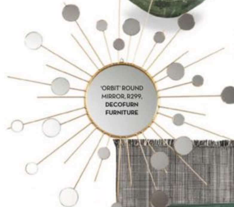
'ORBIT' ROUND MIRROR, R299, DECOFURN FURNITURE