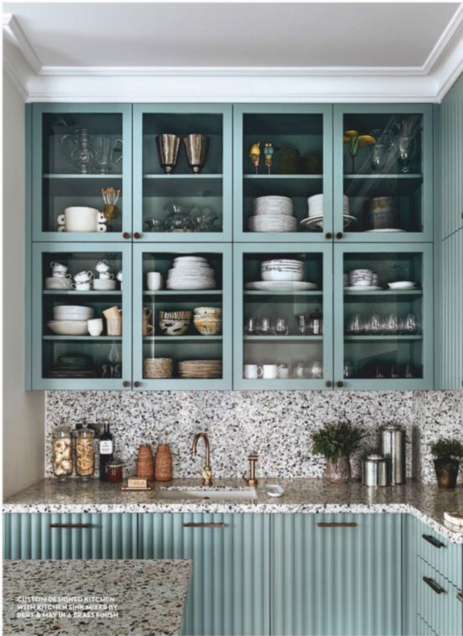
CUSTOM DESIGNED KITCHEN WITH KITCHEN SINK MIXER BY BERT & MAY IN A BRASS FINISH