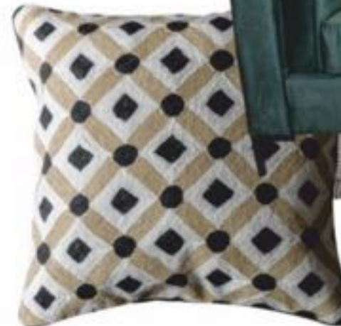
'NIGEN' HAND EMBROIDERED CUSHION, R695, WEYLANDTS