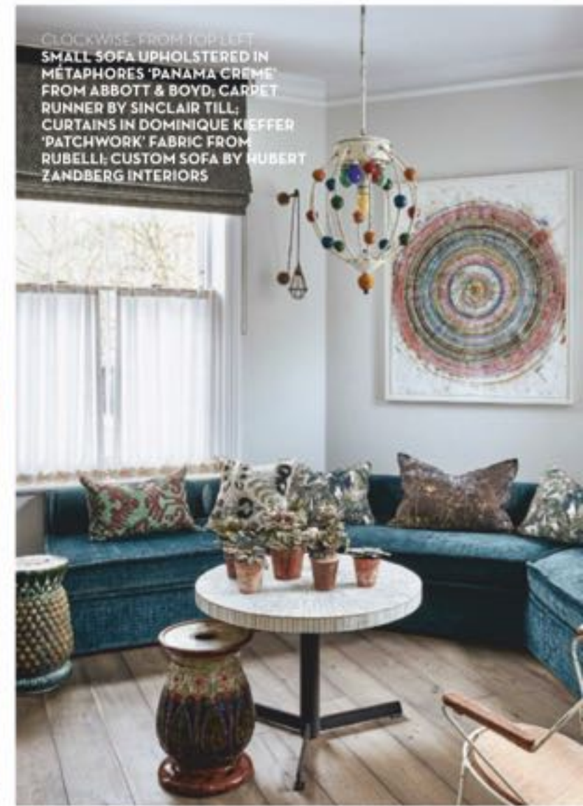
CLOCKWISE, FROM TOP LEFT: SMALL SOFA UPHOLSTERED IN METAPHORES 'PANAMA CREME' FROM ABBOTT & BOYD; CARPET RUNNER BY SINCLAIR TILL; CURTAINS IN DOMINIQUE KIEFFER 'PATCHWORK' FABRIC FROM RUBELLI; CUSTOM SOFA BY HUBERT ZANDBERG INTERIORS