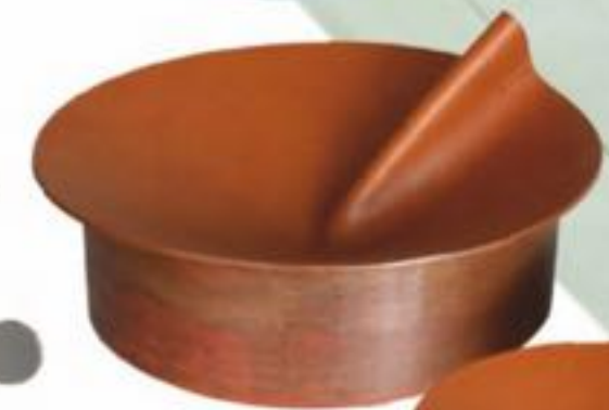
CARA DAVIDE FOR UNIQA 'ROTONDA' DECORATIVE OBJECTS IN TAN BROWN, 2019, POR, CARA DAVIDE