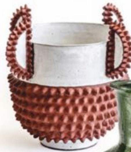
'SISI WAM TROPHY' TERRACOTTA VASE, R5 100, BIELLE BELLINGHAM