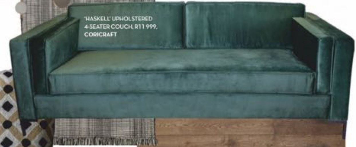
'HASKELL' UPHOLSTERED 4-SEATER COUCH, R11 999, CORICRAFT