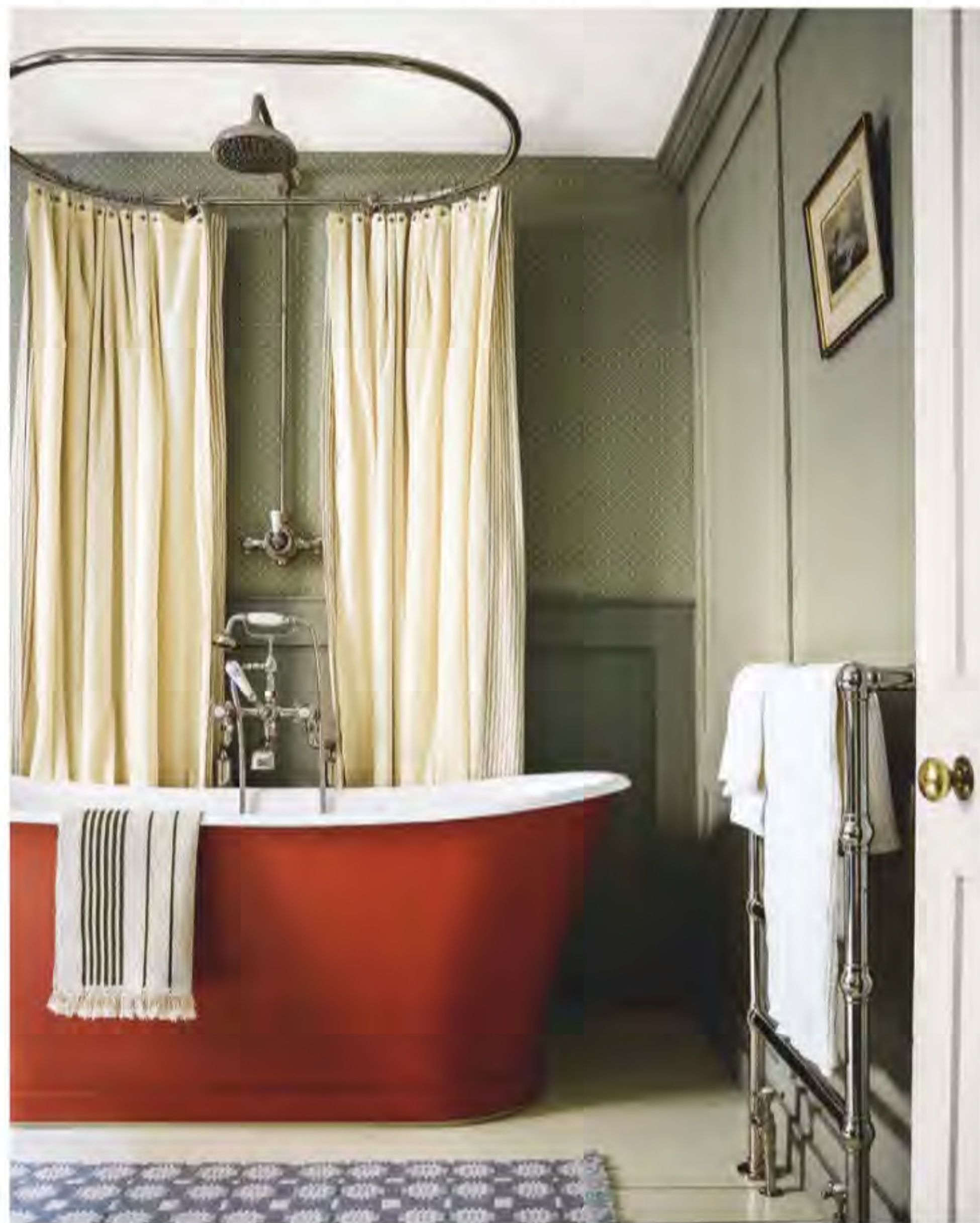
LEFT The bathroom of a Georgian house in London, reconfigured and decorated by Ben Pentreath